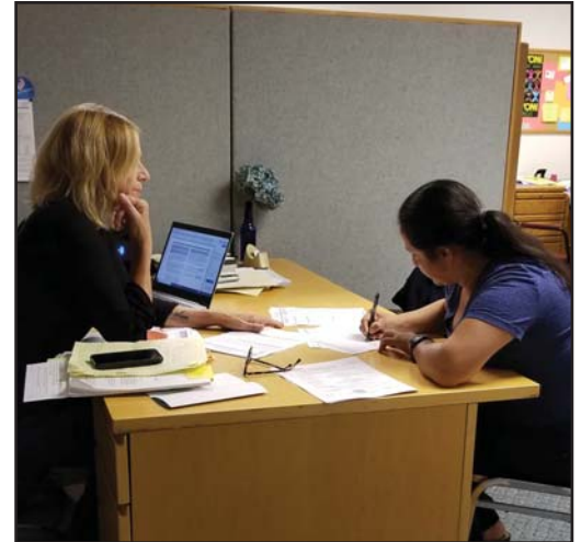
KIAC Accredited Representative provides one-on-one in depth assistance.