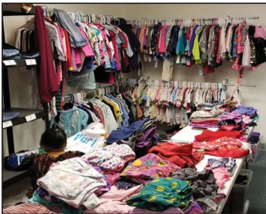
Clothing Closet: Provided by our sharing community!

Last year we served more than 400 individuals, representing nearly 300 families. We are looking forward to new family and youth programming in 2020, continued advocacy for services in the West Sound to be accessible to those with limited English proficiency and varied documentation statuses, and expanded partnerships in healthcare and education.