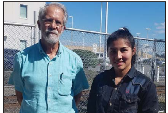
KIAC secured this client's release from Tacoma detention center.