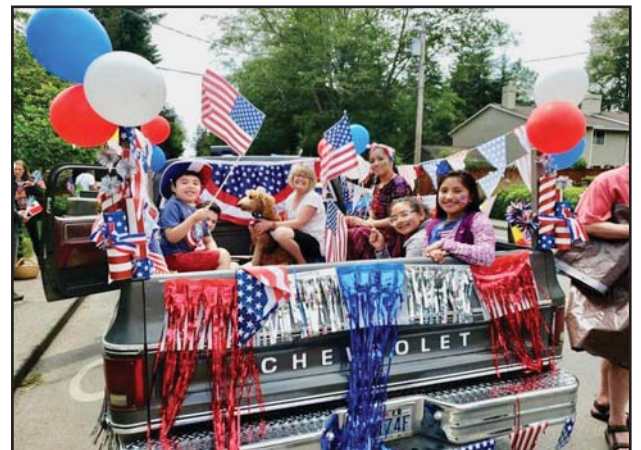
KIAC Float in BI Grand Old 4th of July Parade

KIAC is a 501(c)(3) nonprofit. We are funded primarily by community donations. To find out more and support us, visit: www.kitsapiac.org