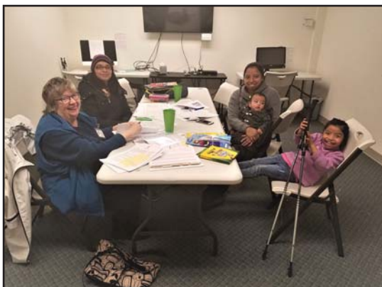
Friendship, support and learning about America while preparing for Citizenship.

We do not know what the future holds. But we know our commitment to our clients and to the immigrant community has never been stronger.