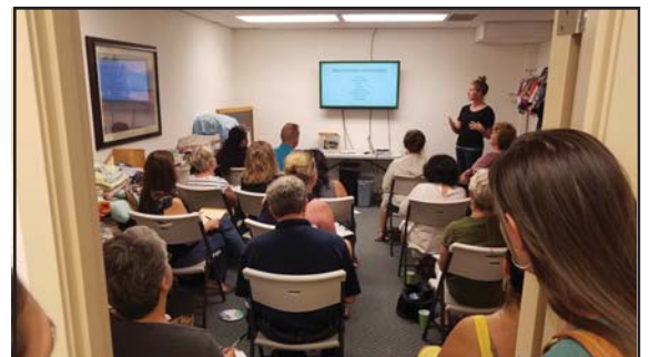
Volunteer Training is provided to ensure high quality services for clients and a fulfilling experience for volunteers.